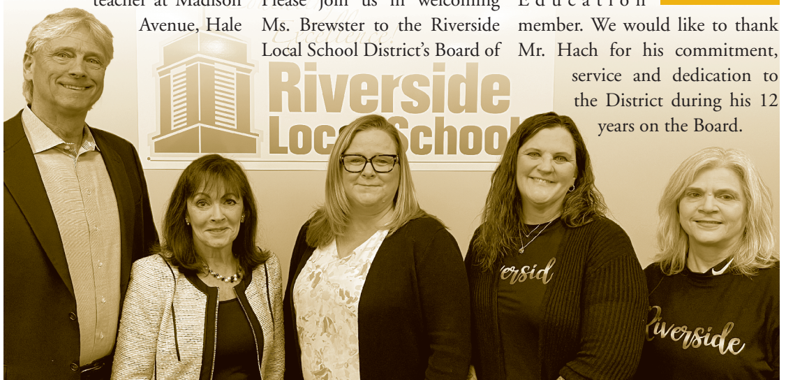
— 2024 RLSD Board of Education Members —