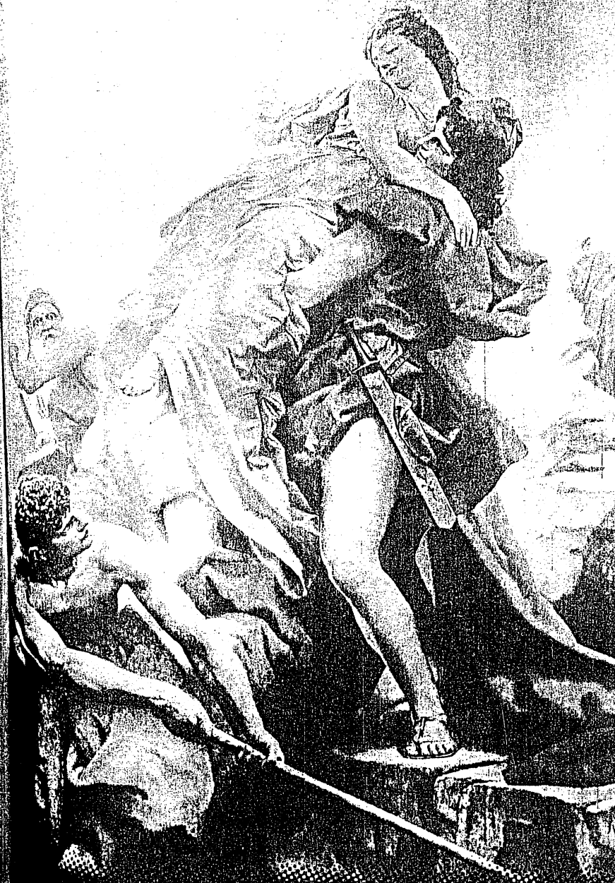
This is how an artist of the 1800s pictured Paris, the Trojan prince, carrying off Helen, the Greek queen of Sparta.

Helen —In Homer's Iliad , she is the wife of the king of Sparta. The Trojan War is said to have started because of her.